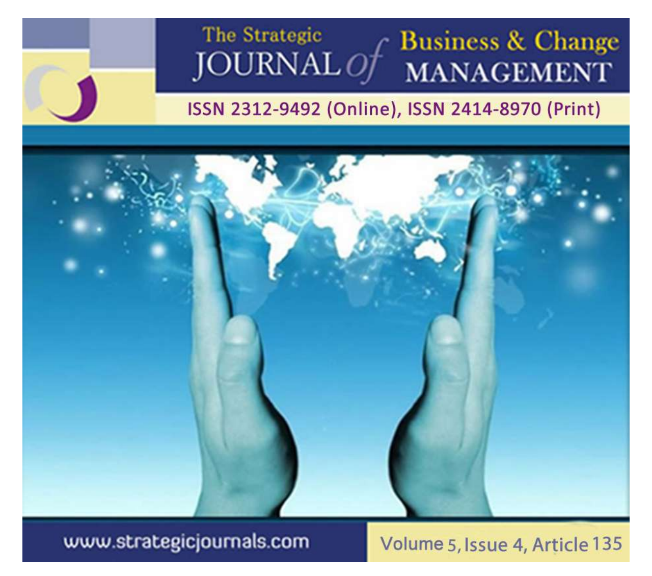
ORGANIZATIONAL PRACTICES ON CHANGE IMPLEMENTATION IN PUBLIC HEALTH FACILITIES IN THARAKA NITHI COUNTY, KENYA