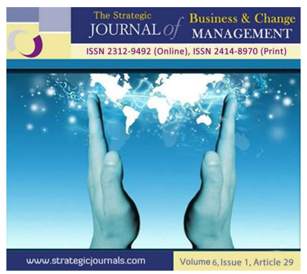
INFLUENCE OF PROCUREMENT OUTSOURCING PRACTICES ON PERFORMANCE OF MANUFACTURING FIRMS IN NAIROBI COUNTY, KENYA