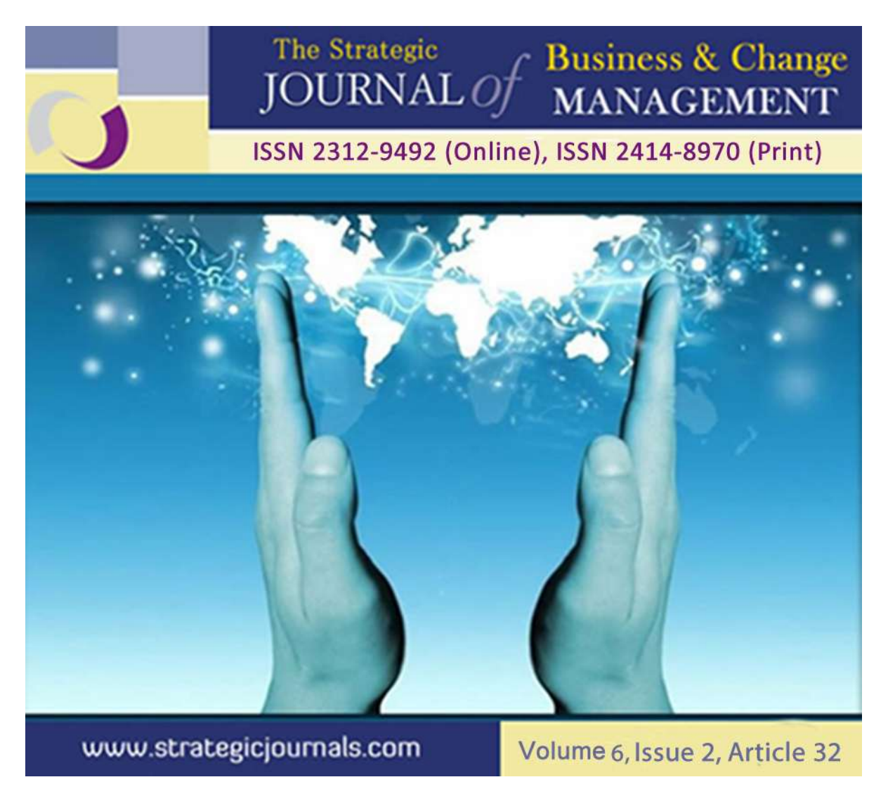
EFFECT OF SOCIAL NETWORKING ON EMPLOYEE PERFORMANCE: A CASE STUDY OF COAST WATER SERVICE BOARD