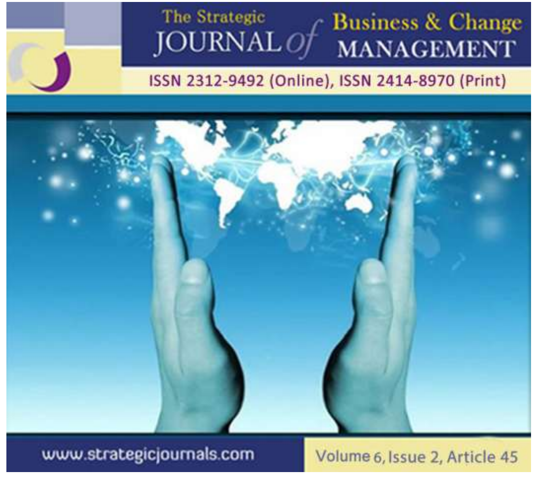
DETERMINANTS OF E-PROCUREMENT PERFORMANCE IN COUNTY GOVERNMENTS. A CASE OF KAJIADO COUNTY, KENYA