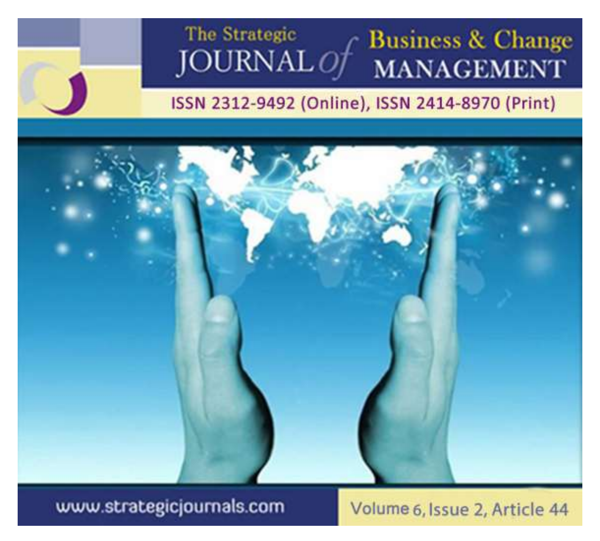
EFFECT OF STRATEGIC MANAGEMENT ON ORGANIZATIONAL PERFORMANCE OF BEACH HOTELS ALONG COASTLINE OF MOMBASA