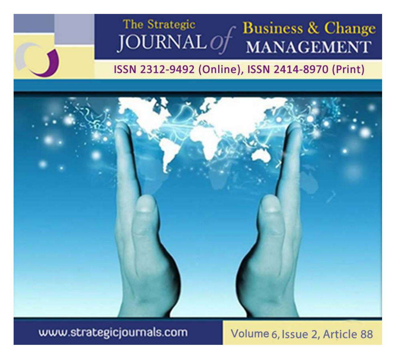
INFLUENCE OF CUSTOMER RELATIONSHIP ON PERFORMANCE OF GRAINS PROCESSING INDUSTRIES IN ELDORET TOWN