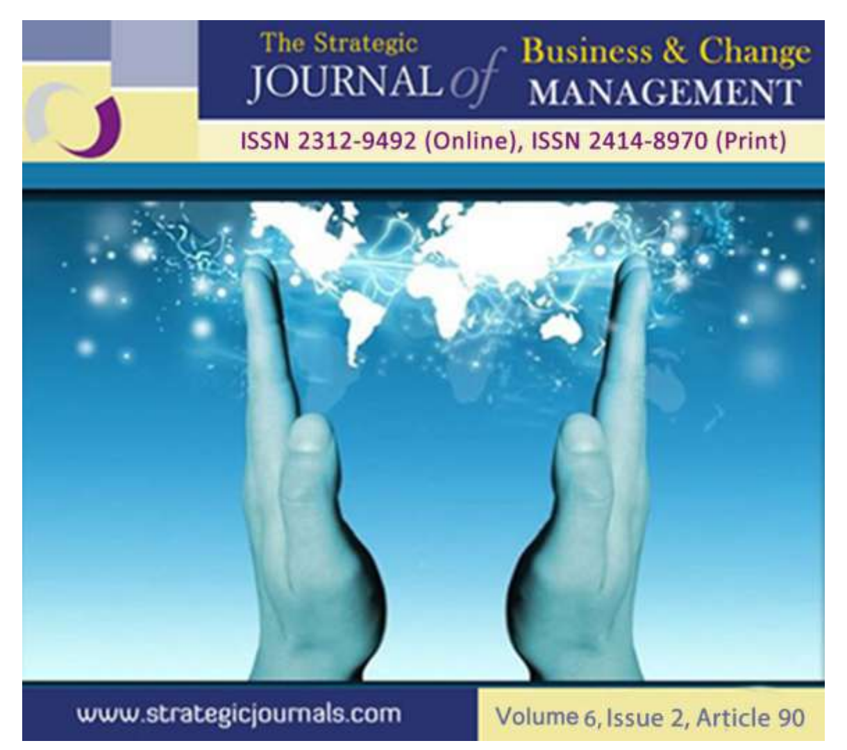
INFLUENCE OF GREEN SUPPLY CHAIN MANAGEMENT PRACTICES ON PROCUREMENT PERFORMANCE OF PRIVATE HEALTH INSTITUTIONS IN KENYA: A CASE OF AGA KHAN HOSPITAL KISUMU