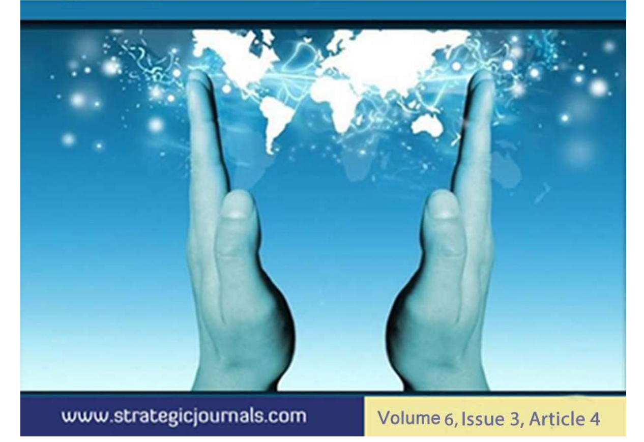
EFFECT OF STOCK MANAGEMENT ON FINANCIAL PERFORMANCE OF SWEET POTATO MARKETING COOPERATIVES IN KENYA

ISSN 2312-9492 (Online), ISSN 2414-8970 (Print)