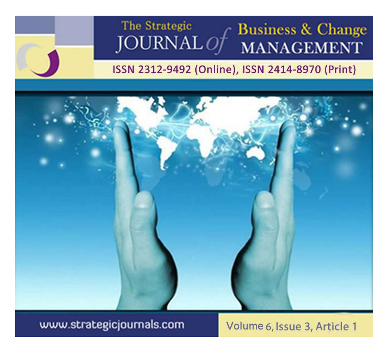
INFLUENCE OF CORE BANKING SYSTEM ON PERFORMANCE OF NATIONAL INDUSTRIAL CREDIT BANK IN KENYA