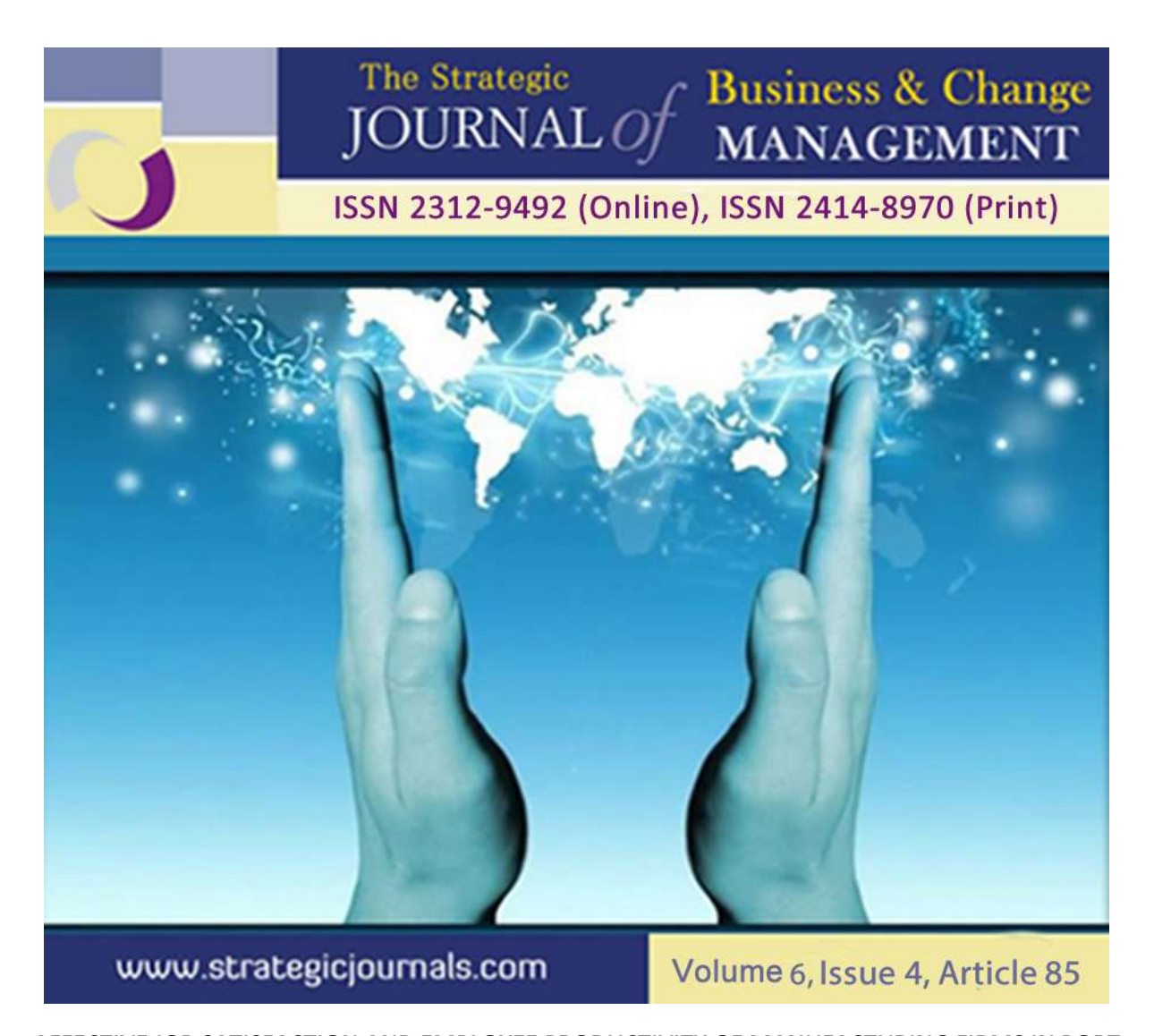
AFFECTIVE JOB SATISFACTION AND EMPLOYEE PRODUCTIVITY OF MANUFACTURING FIRMS IN PORT HARCOURT, NIGERIA