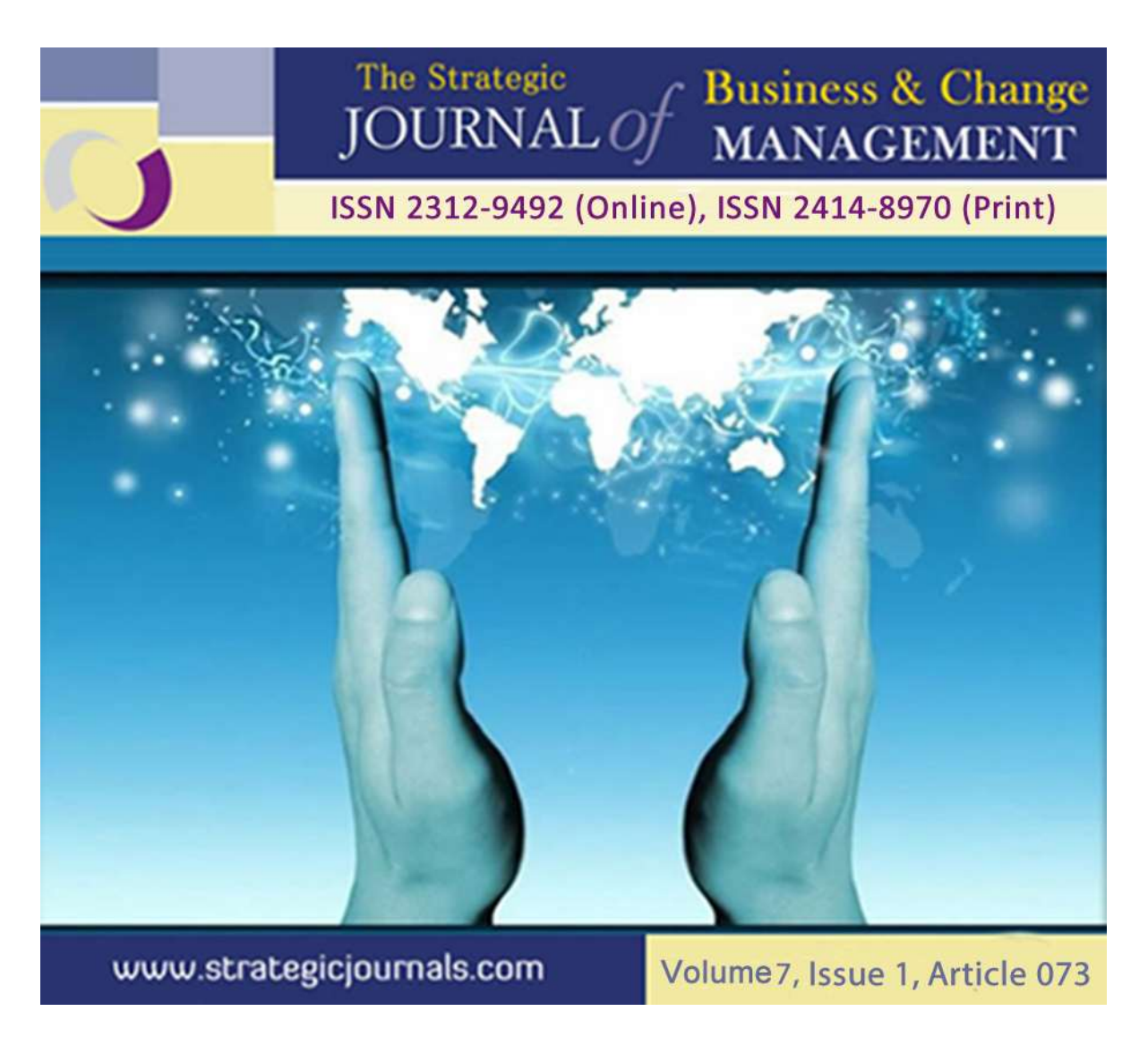
THE ROLE OF SERVICE AGREEMENT ON THE PERFORMANCE OF AGRICULTURAL STATE CORPORATIONS IN KENYA