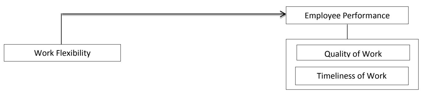
Figure 1: Conceptual framework for the relationship between work flexibility and employee performance