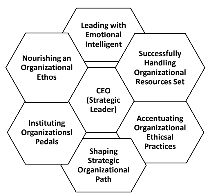
Figure 1: Six ways chief executive officer of Fortune 500 companies can make a difference in their organizational performance