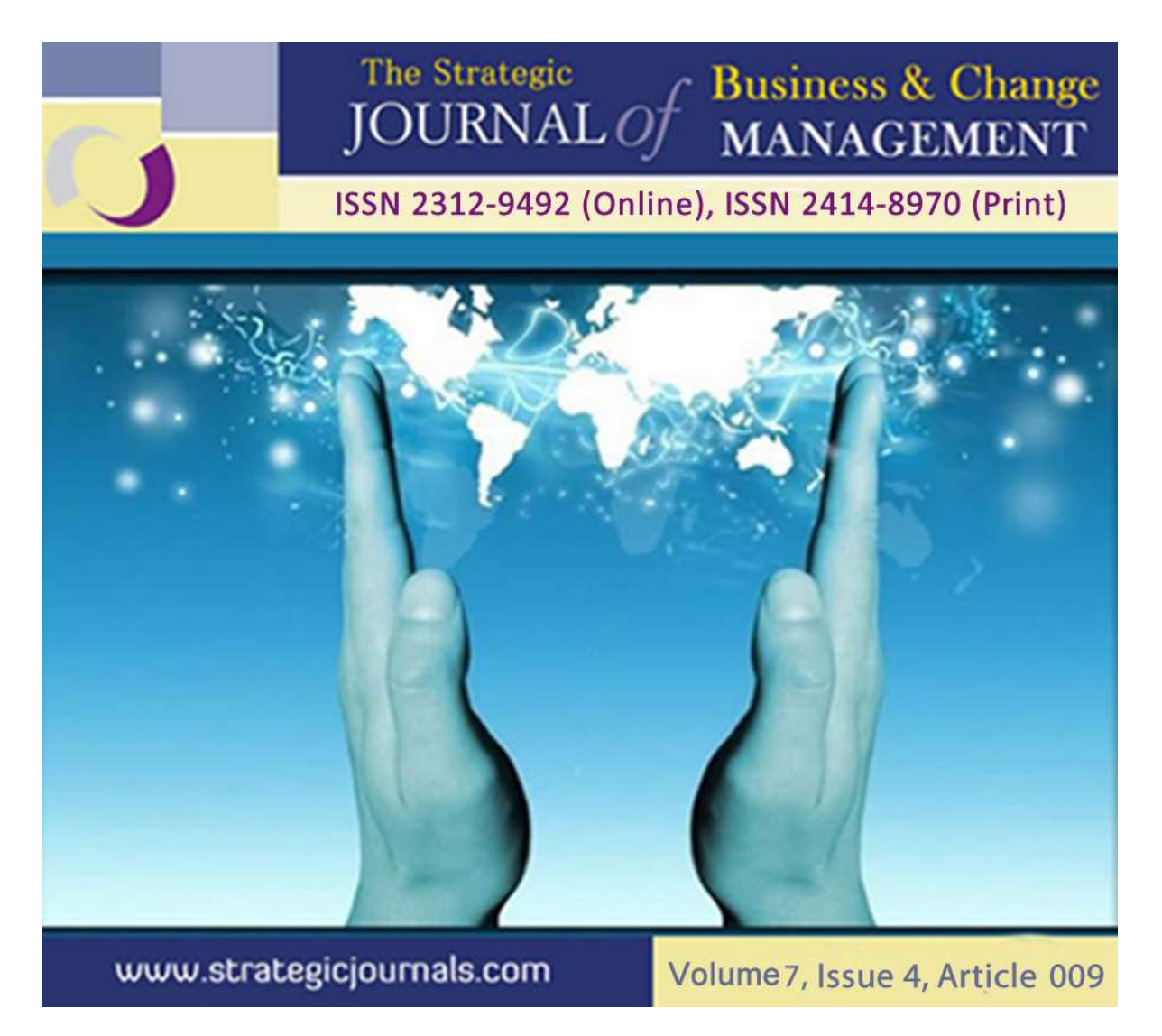
DETERMINANTS OF SUSTAINABILITY OF YOUTH EMPOWERMENT PROJECTS IN MACHAKOS COUNTY, KENYA