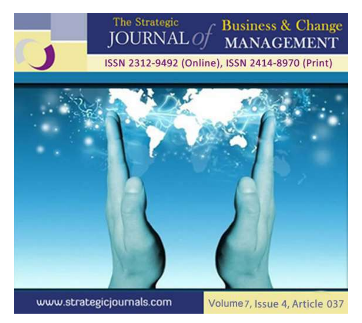
EFFECT OF MICROFINANCE INTERVENTIONS ON FINANCIAL EMPOWERMENT OF WOMEN A CASE OF MOMBASA COUNTY, KENYA