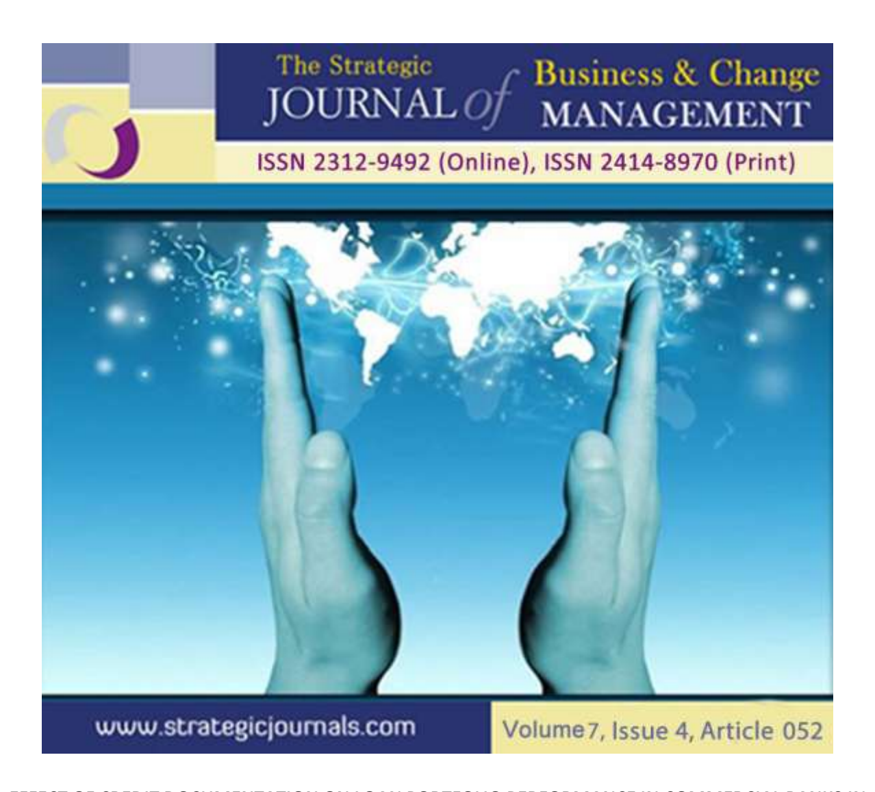
EFFECT OF CREDIT DOCUMENTATION ON LOAN PORTFOLIO PERFORMANCE IN COMMERCIAL BANKS IN MOMBASA COUNTY: A CASE OF KENYA COMMERCIAL BANK