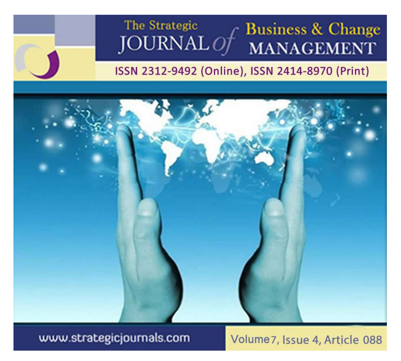
THE ROLE OF CONTRACT MONITORING ON PERFORMANCE OF CONSTRUCTION CONTRACTS IN COUNTY GOVERNMENT OF BUSIA