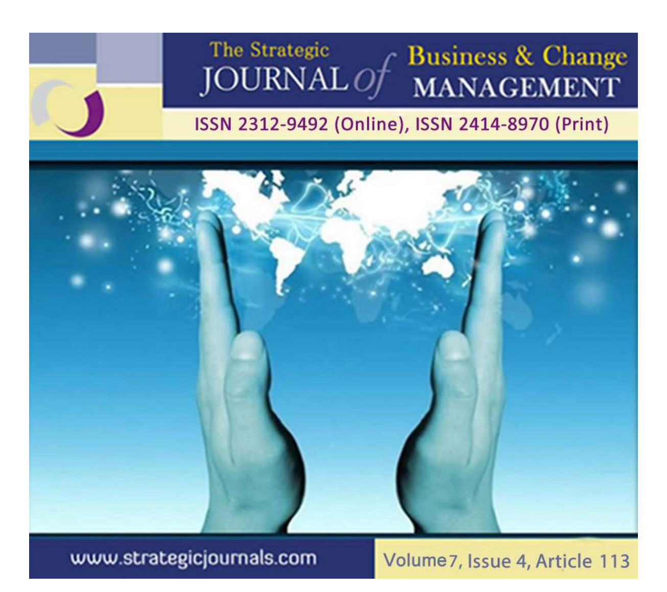
RELATIONSHIP BETWEEN CAREER MANAGEMENT STRATEGIES AND EMPLOYEE PERFORMANCE IN STATE CORPORATIONS IN KENYA