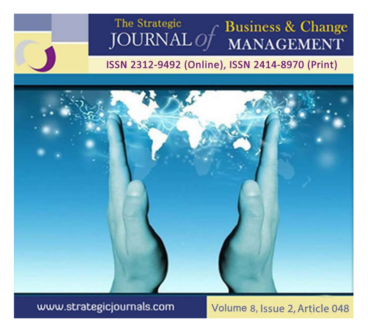
EMPLOYEE PARTICIPATION AND ORGANIZATIONAL PRODUCTIVITY OF SMALL AND MEDIUM SCALE ENTERPRISES