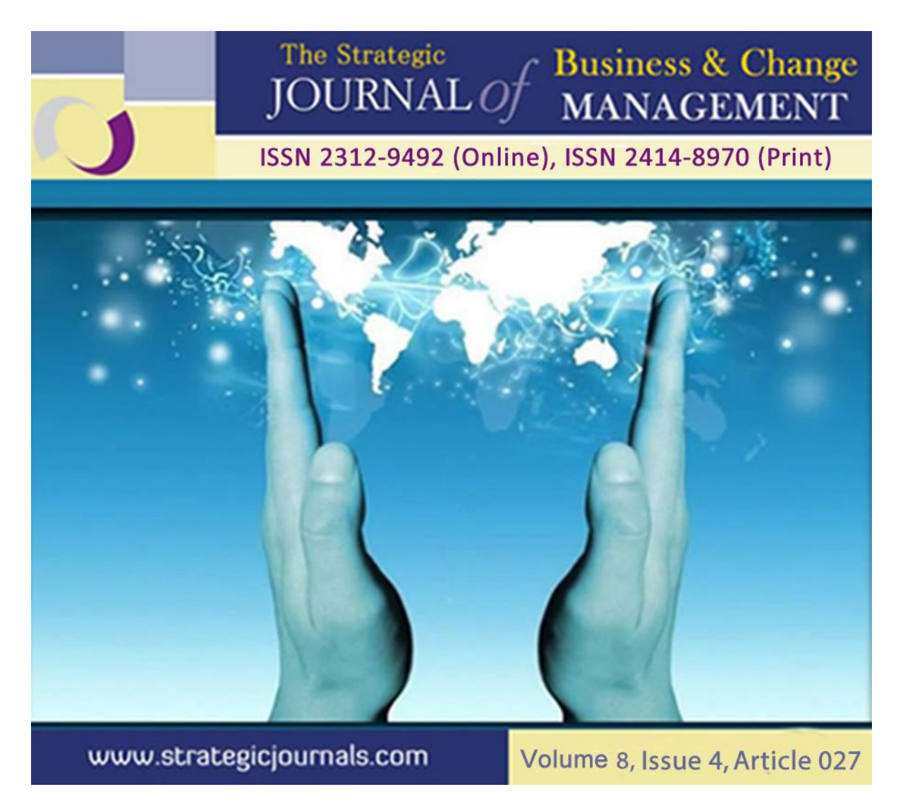
PRODUCT DIVERSIFICATION AND PERFORMANCE OF FOREIGN FAST FOOD RESTAURANTS IN NAIROBI CITY COUNTY, KENYA