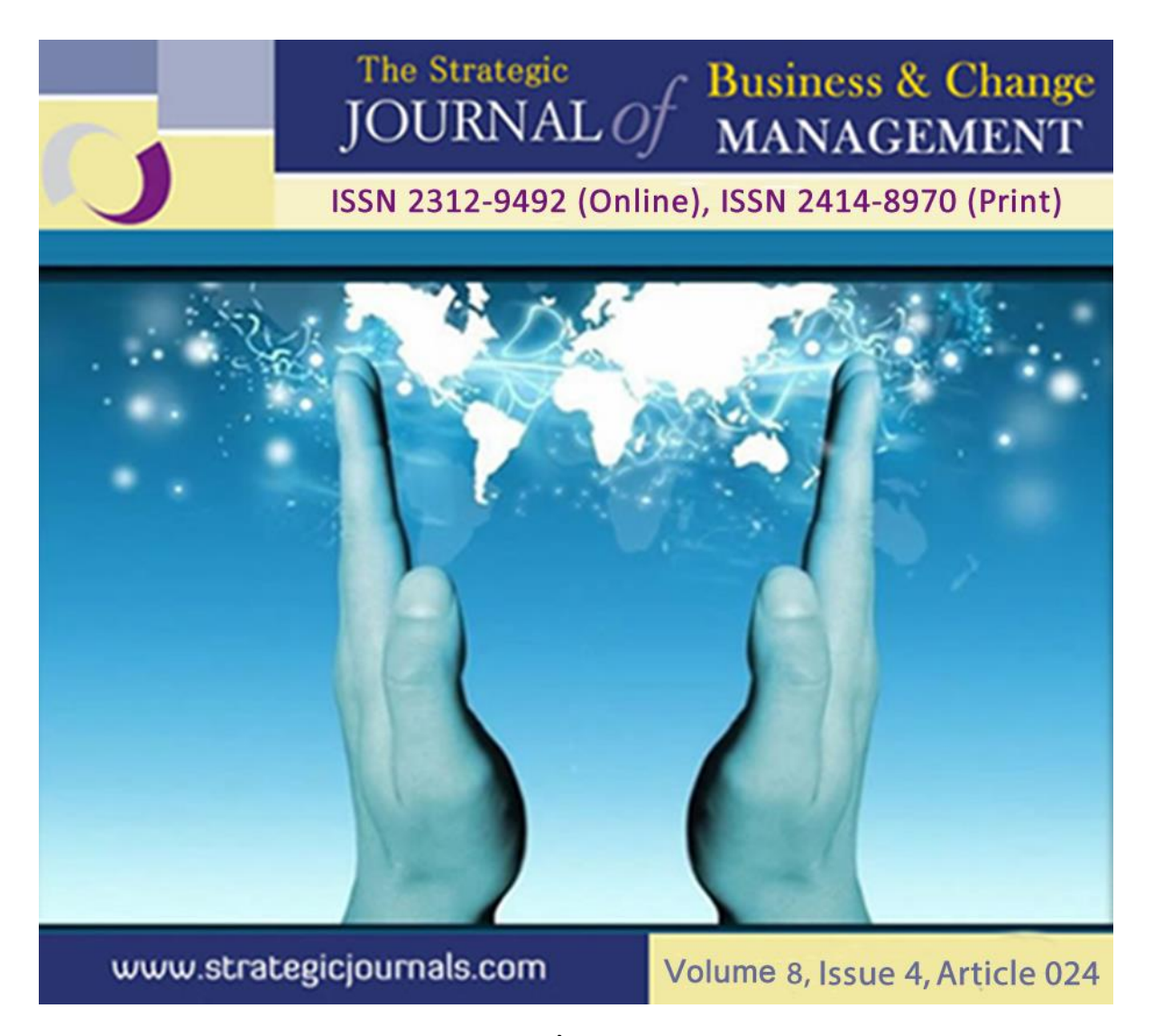
STRATEGIES PUT IN PLACE TO FACILITATE REFUGEES` ACCESS TO HUMANITARIAN AID IN KAKUMA REFUGEE CAMP, KENYA