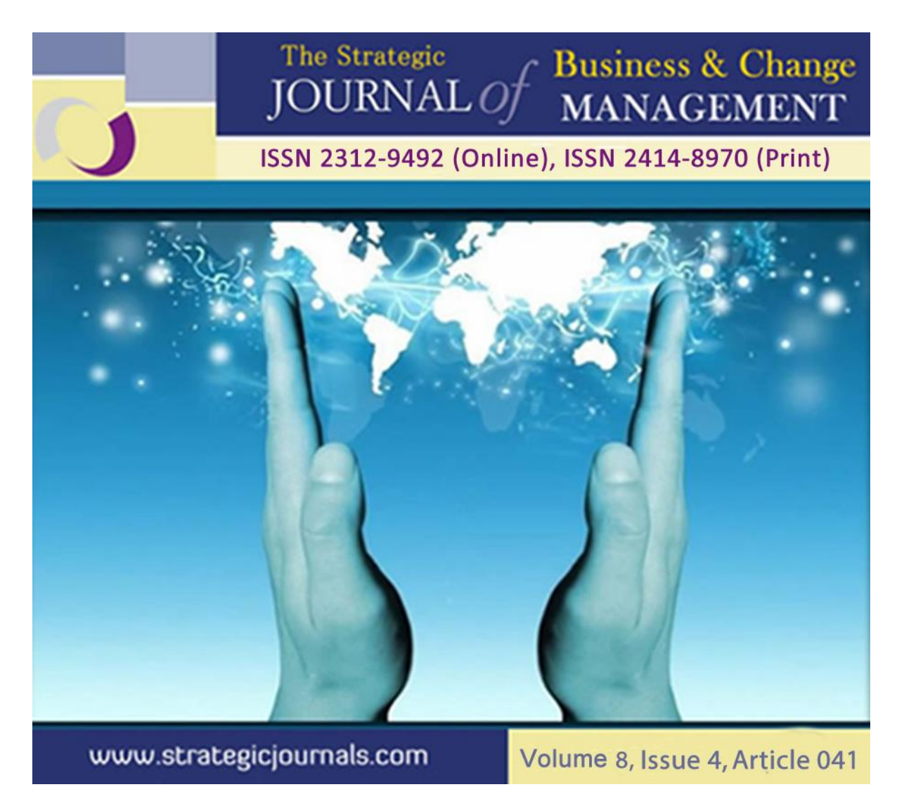
EMPLOYEE COMPETENCE MANAGEMENT AND CORPORATE VITALITY OF INDIGENOUS OIL AND GAS COMPANIES IN SOUTH-SOUTH, NIGERIA