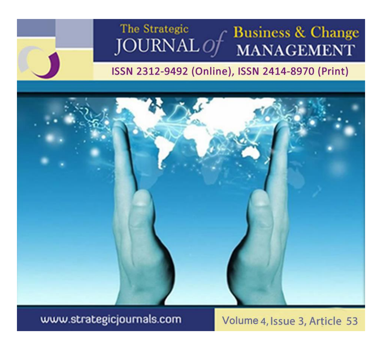
DETERMINANTS OF BUDGETARY ALLOCATION PROCESS IN COUNTY GOVERNMENTS IN KENYA: A CASE OF MANDERA COUNTY