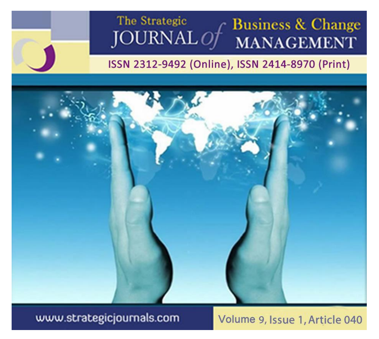
GIG ECONOMY APPLICATION AND ORGANIZATIONAL PRODUCTIVITY OF LOGISTIC COMPANIES IN RIVER STATE, NIGERIA