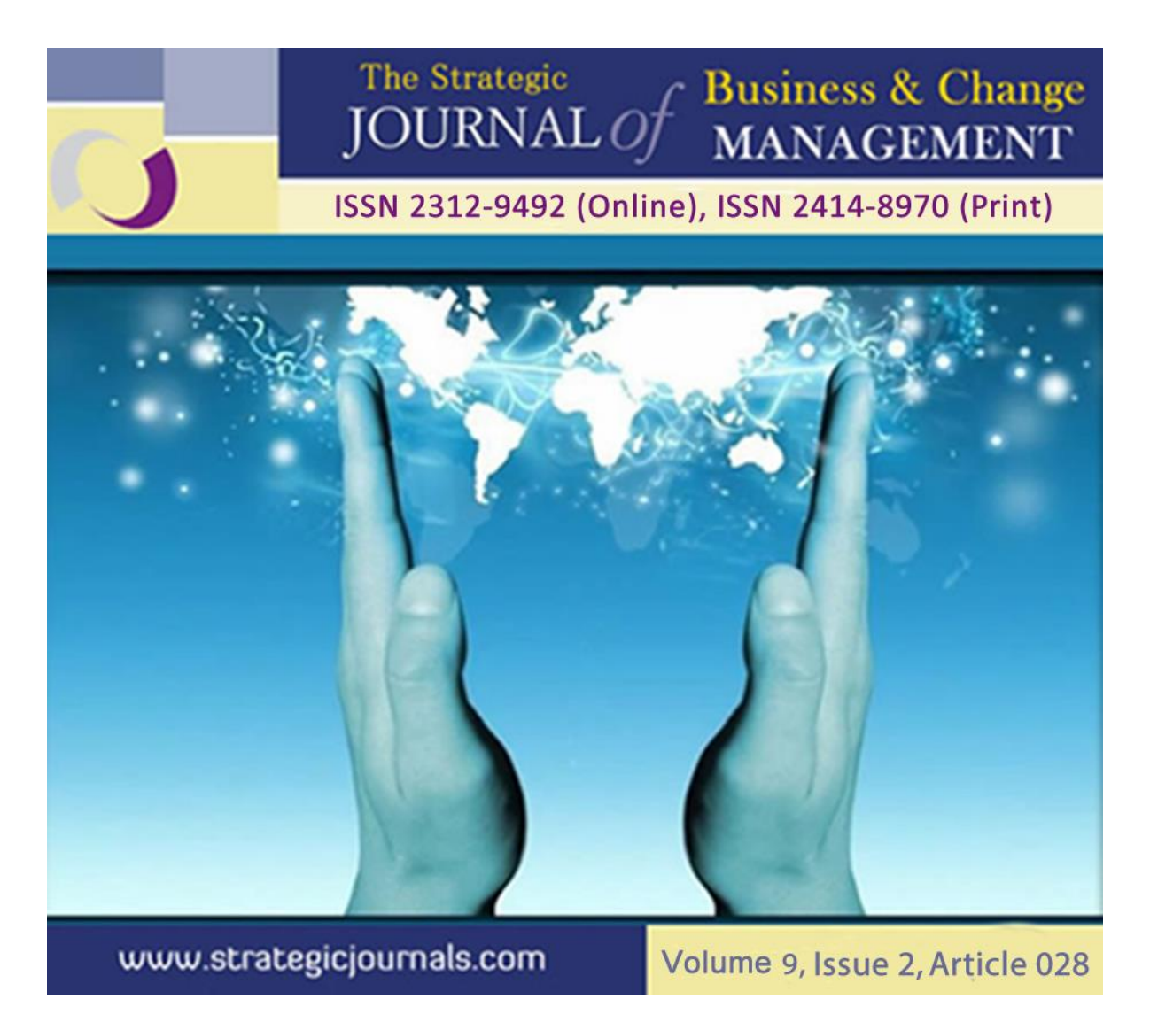
EFFECT OF MONITORING AND EVALUATION PLANNING ON SUCCESS OF RURAL WATER CHLORINATION PROJECTS, A CASE OF CHLORINE DISPENSERS PROJECT IN WESTERN; KENYA