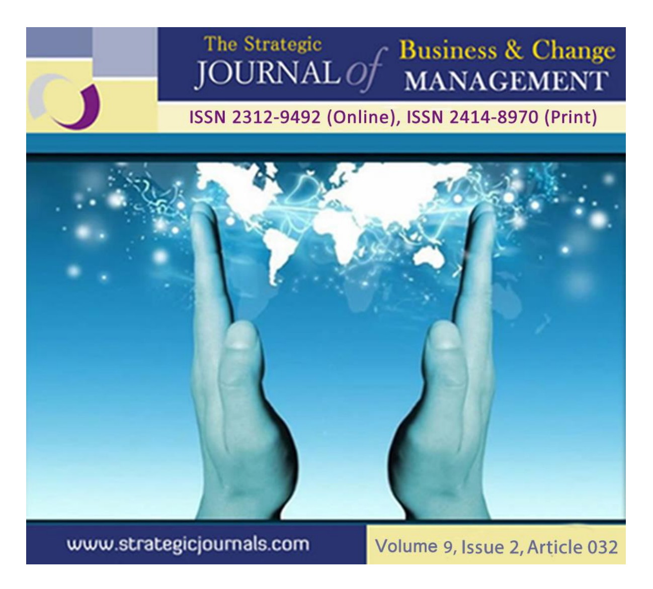
TASK MANAGEMENT INITIATIVES AND EMPLOYEE PERFORMANCE IN EXPORT PROCESSING ZONES IN ATHI-RIVER, MACHAKOS COUNTY, KENYA