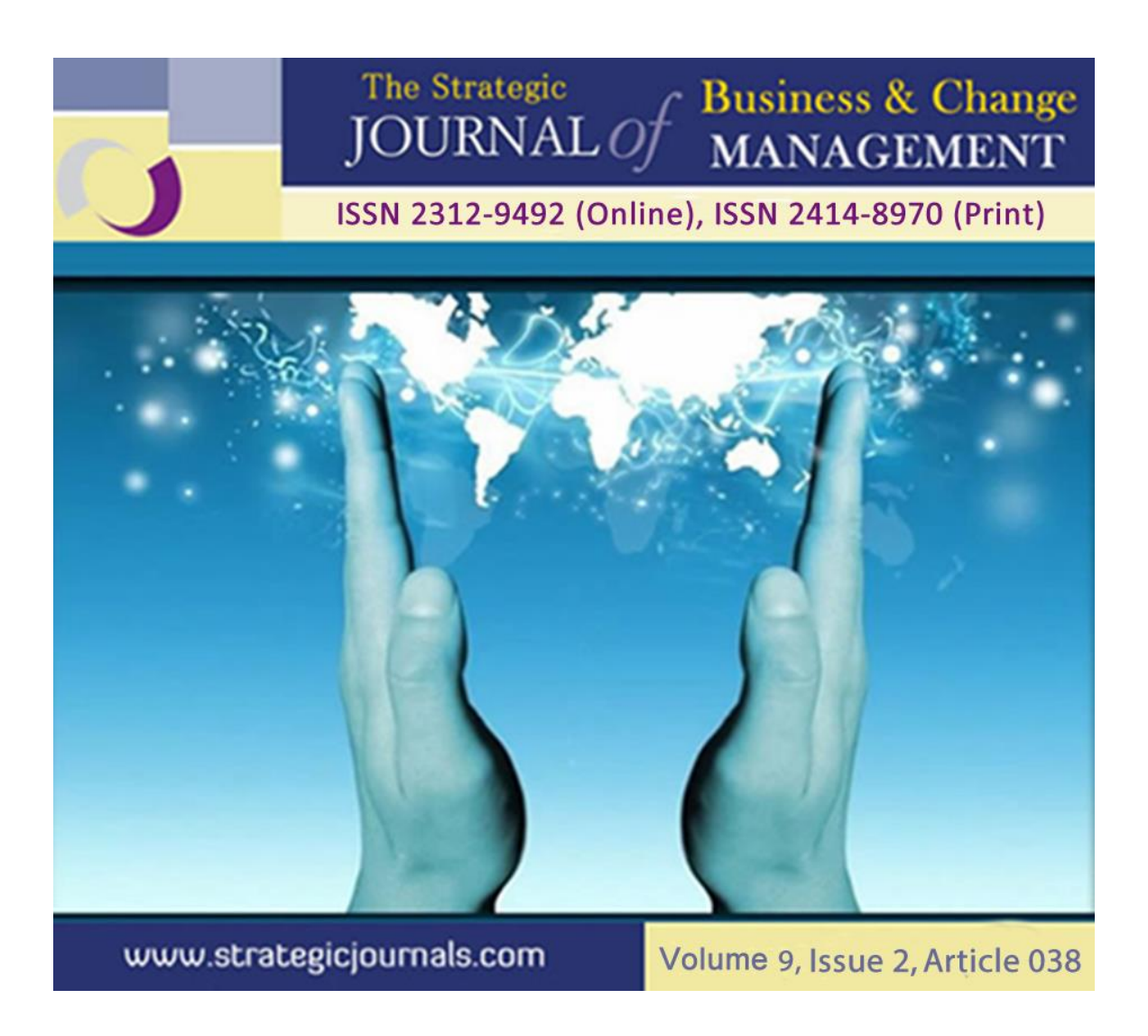
EFFECT OF ORGANIZATIONAL SOFT ELEMENTS ON IMPLEMENTATION OF STRATEGIC PLANS: A CASE OF COUNTY ASSEMBLIES OF COASTAL COUNTIES OF KENYA