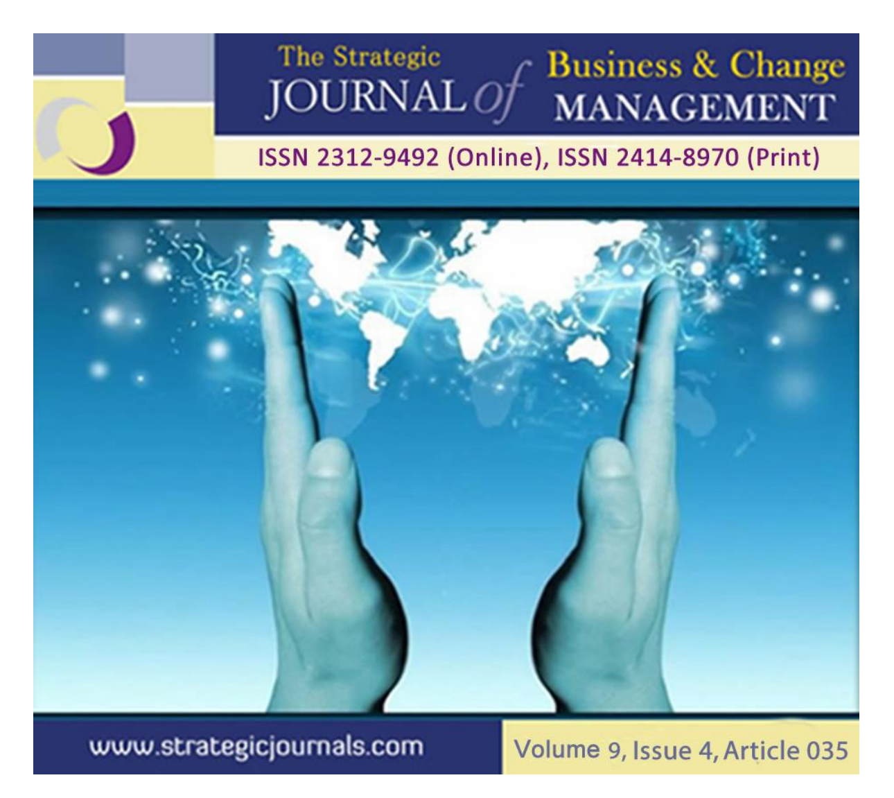
THE EFFECT OF POST-CONTRACTING PROCUREMENT PRACTICES ON SUPPLY CHAIN PERFORMANCE IN ROAD SECTOR IN KAKAMEGA COUNTY