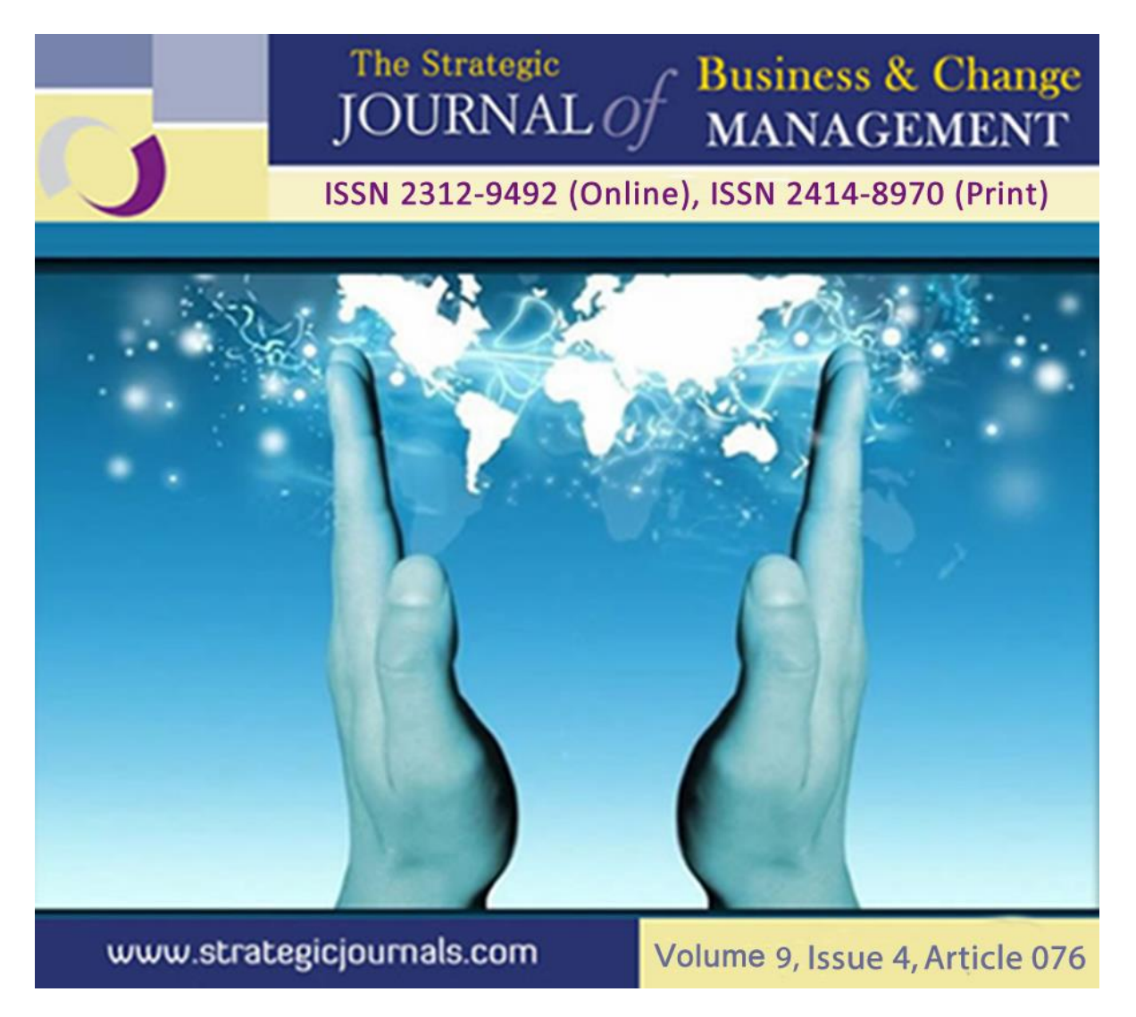
INFLUENCE OF STRATEGIC CHANGE MANAGEMENT PRACTICES ON THE PERFORMANCE OF KENYA PORTS AUTHORITY