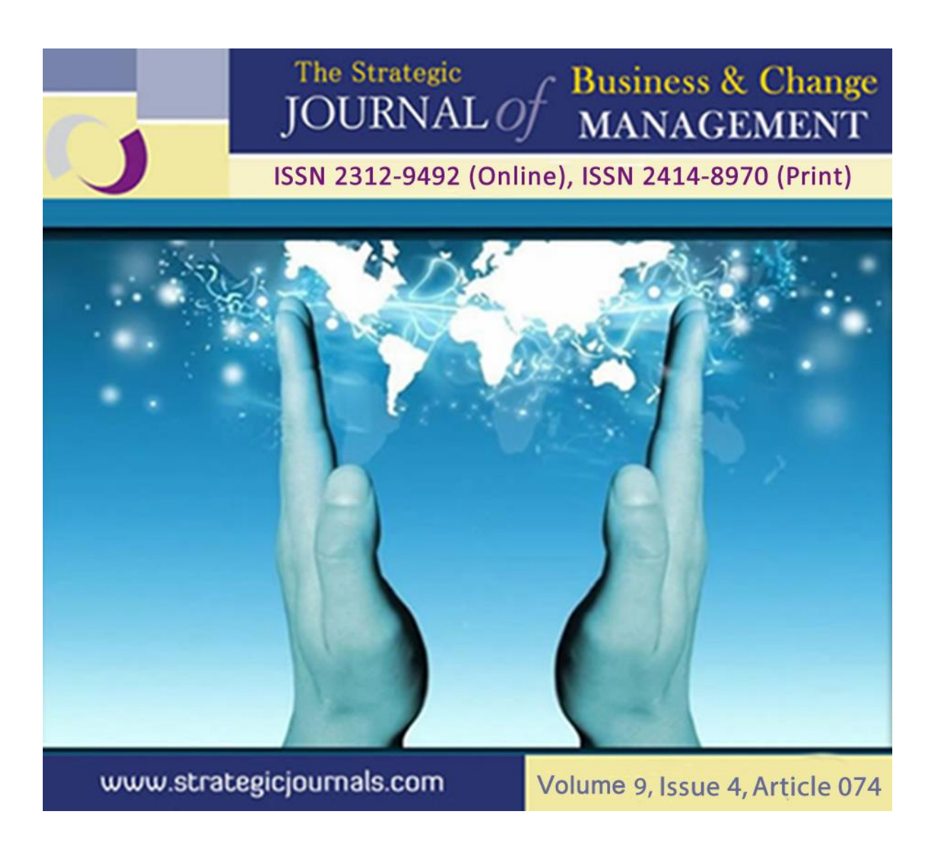
INFLUENCE OF PUBLIC PARTICIPATION IN SERVICE DELIVERY IN THE DEVOLVED SYSTEM OF GOVERNMENT IN KENYA