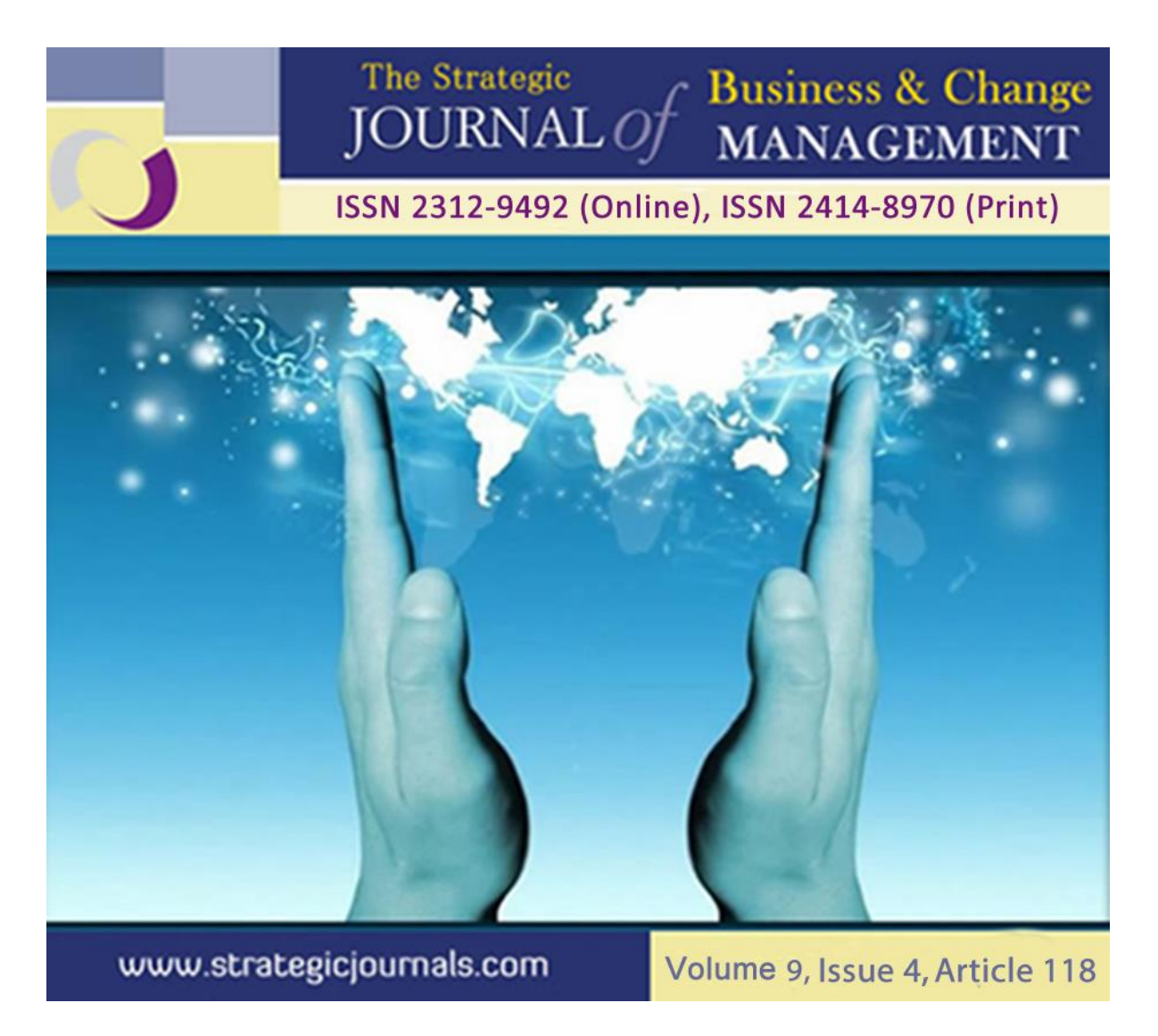
EFFECTS OF MICROFINANCE PRODUCTS AND SERVICES ON THE EMPOWERMENT OF WOMEN IN SEMI-RURAL AREAS-BURUNDI. (CASE STUDY OF AFADE, CIBITOKE-DISTRICT)