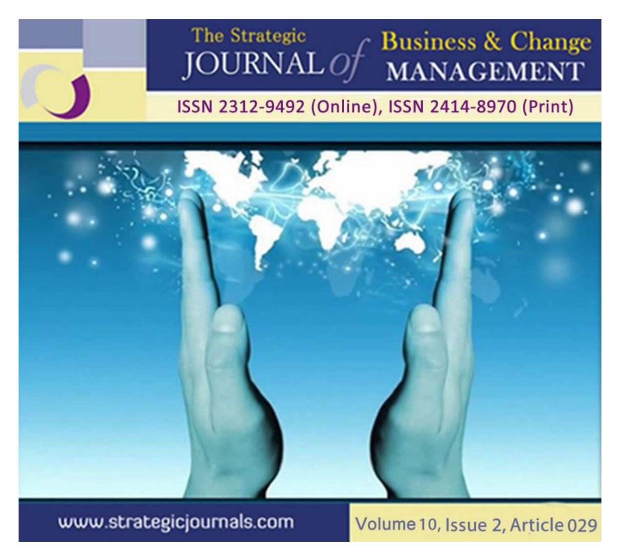
FIRM STABILITY AND FINANCIAL PERFORMANCE AMONG PUBLIC SUGAR MANUFACTURING COMPANIES IN KENYA