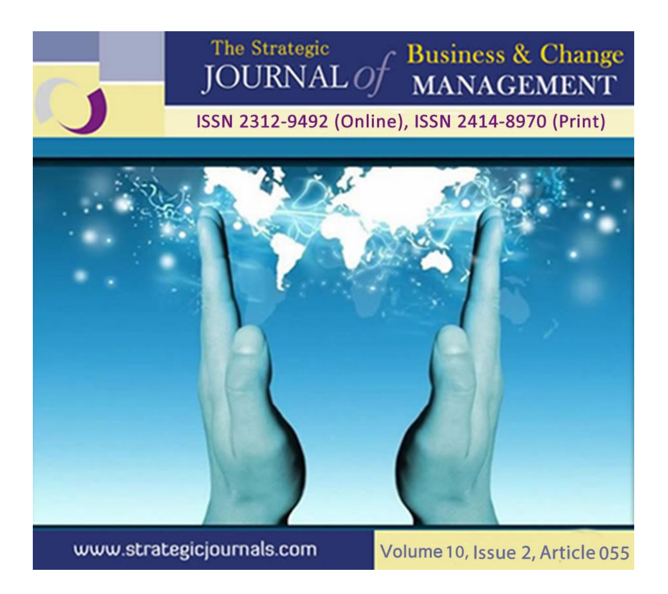
EFFECT OF BANK LOAN FINANCING ON FINANCIAL PERFORMANCE OF SMES IN MOMBASA COUNTY, KENYA