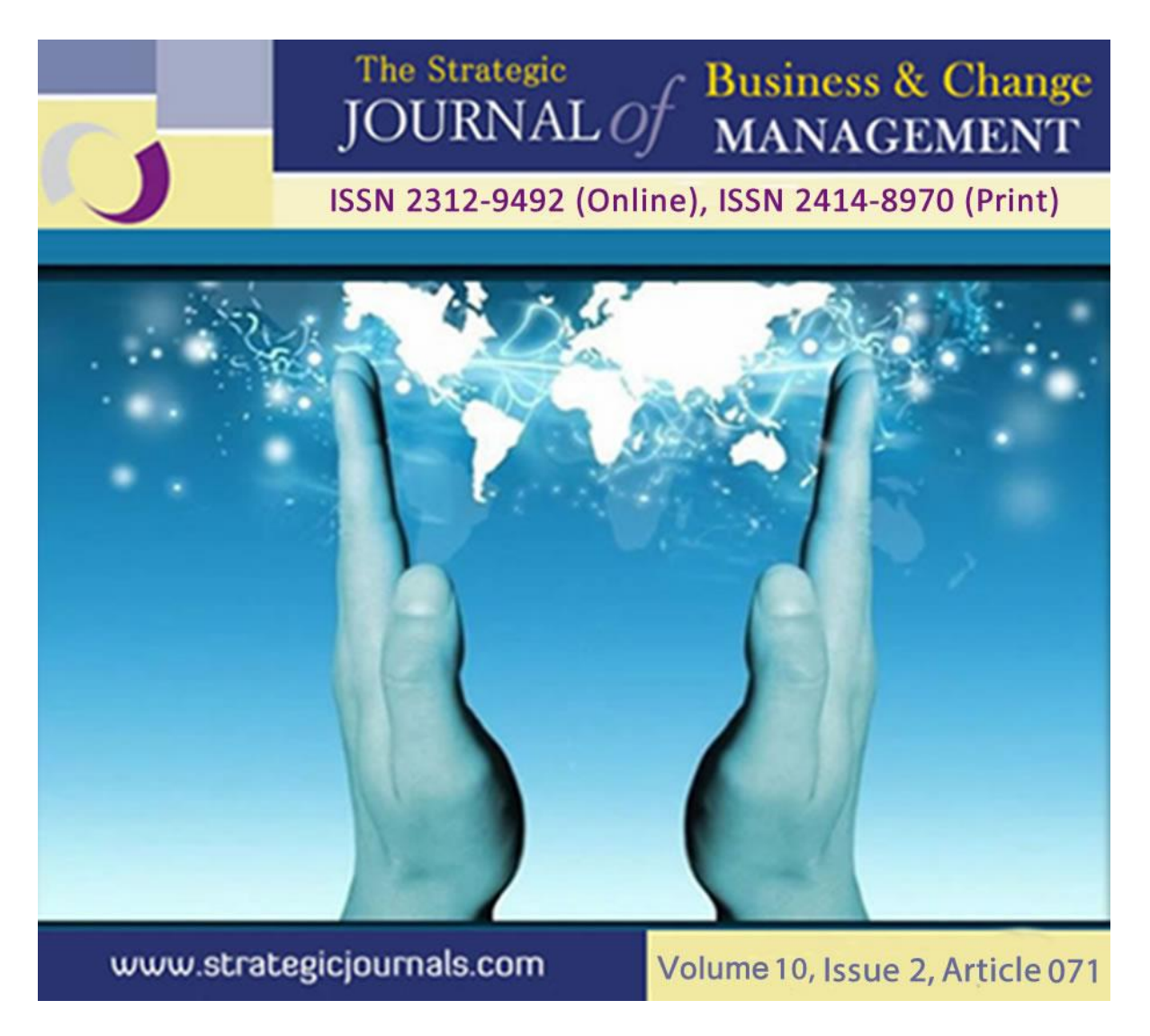
RELATIONSHIP MARKETING STRATEGIES ON CUSTOMER RETENTION IN THE POSTAL CORPORATION OF KENYA, NAIROBI REGION