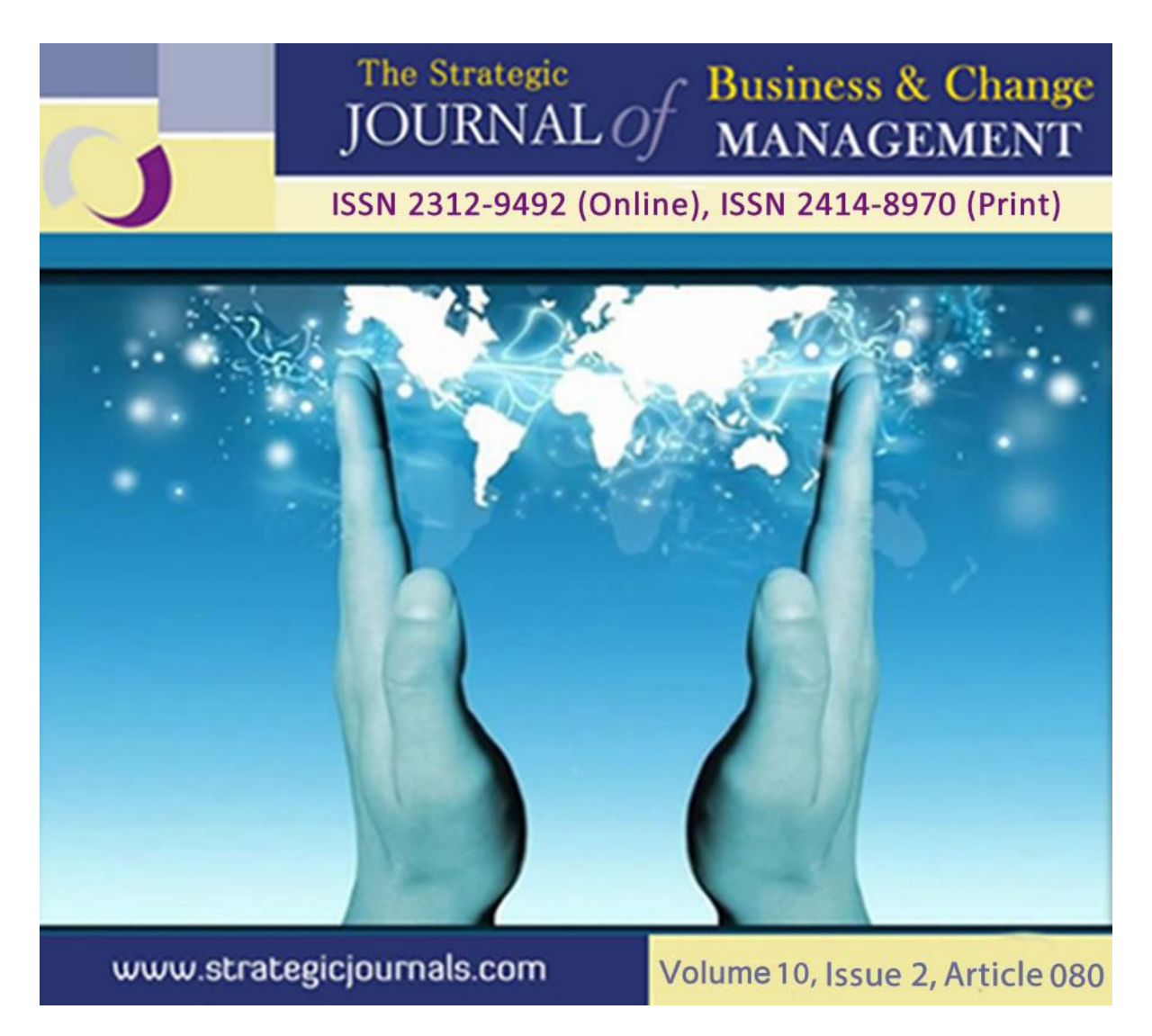
TRAINING AS A SUCCESSION MANAGEMENT TOOL AND PERFORMANCE OF NATIONAL POLICE SERVICE OFFICERS