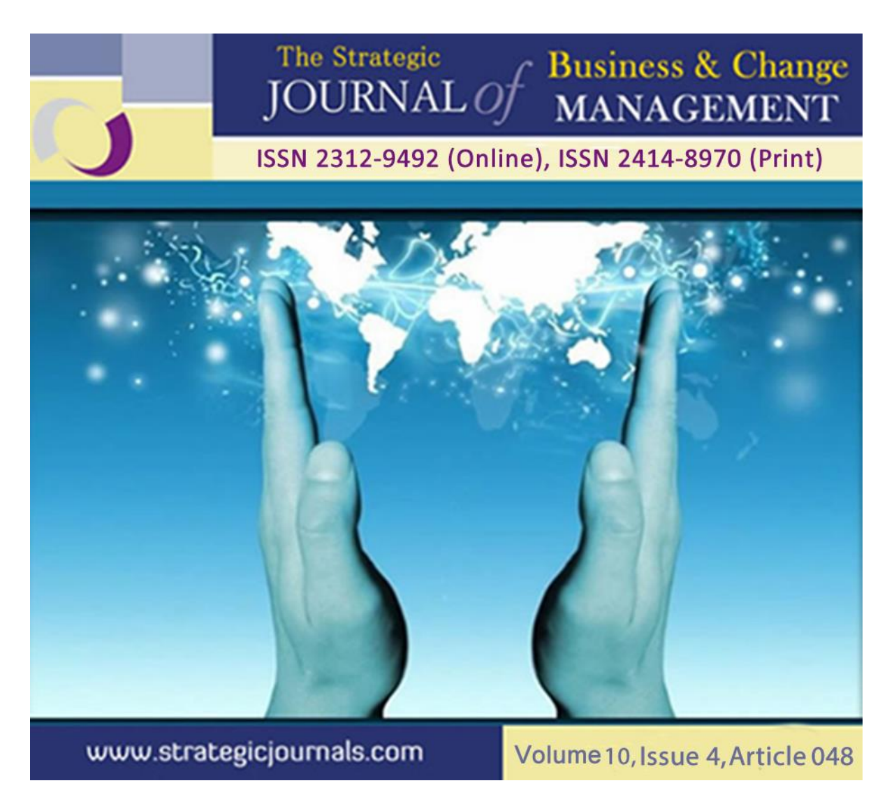
RISK BASED AUDITING AND CORPORATE GOVERNANCE COMPLIANCE AMONG COMMERCIAL STATE CORPORATIONS IN KENYA