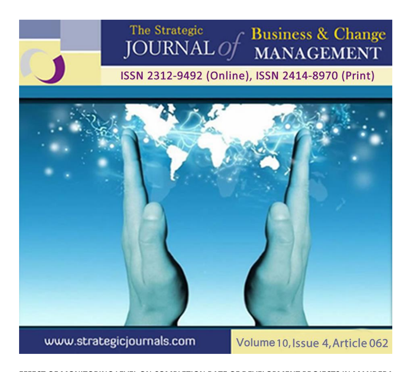
EFFECT OF MONITORING LEVEL ON COMPLETION RATE OF DEVELOPMENT PROJECTS IN MANDERA COUNTY, KENYA