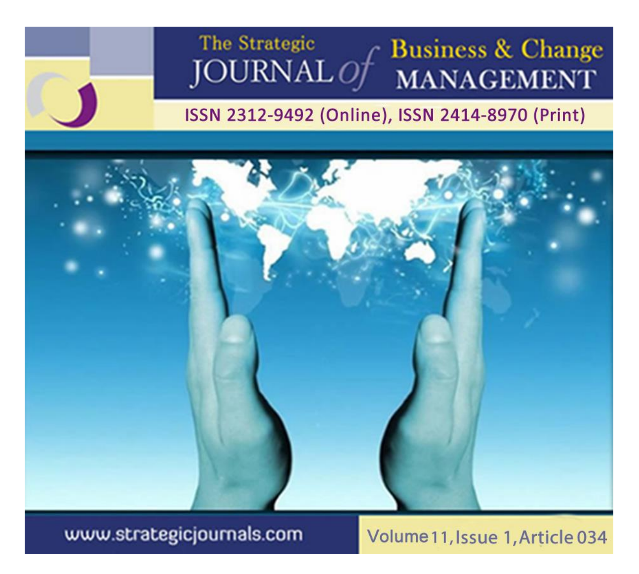
EFFECT OF EXTERNAL AUDITING ON FIRM PERFORMANCE OF FINANCIAL INSTITUTIONS IN RWANDA: A CASE OF BANK OF KIGALI, HEAD QUARTER