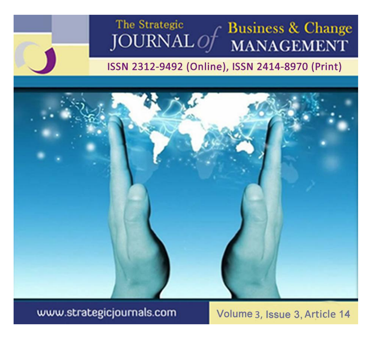
INFLUENCE OF VISIONING MANAGERS ON ORGANIZATIONAL PERFORMANCE OF COMMERCIAL BANKS IN KENYA