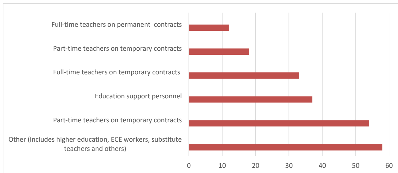
Figure 2: School closure had large impact on education workforce remuneration and employment (percentage)

pre-primary providers and educators within the overall education personnel structure (UNESCO, 2020).