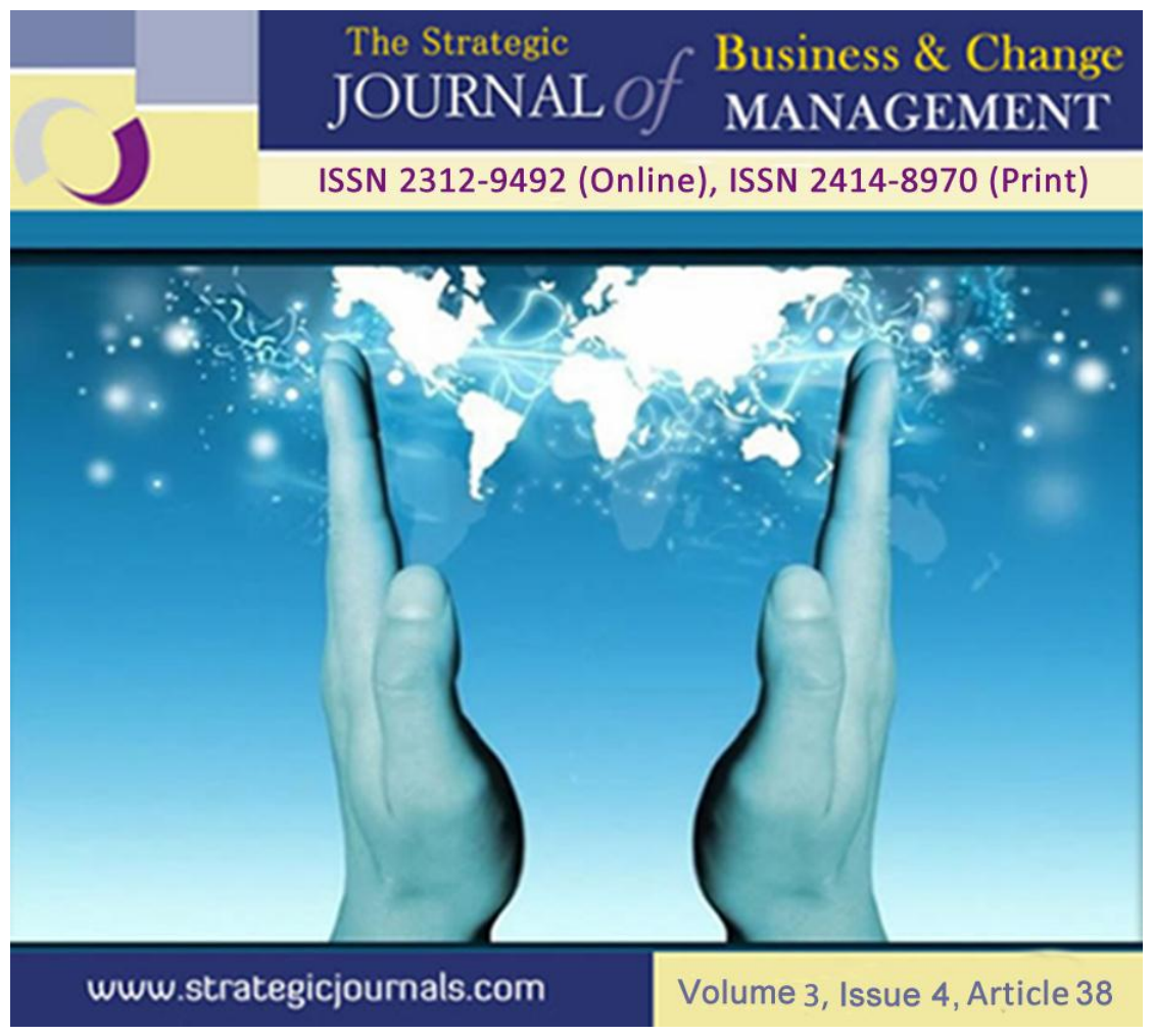
INFLUENCE OF HUMAN RESOURCE MANAGEMENT PRACTICES ON EMPLOYEE COMMITMENT IN PUBLIC HOSPITALS IN NAIROBI COUNTY, KENYA