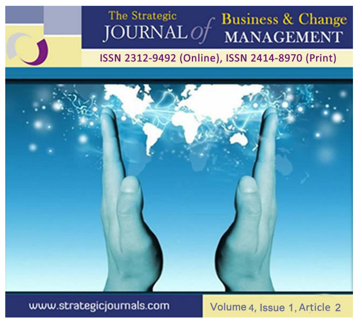
ROLE OF EXTERNAL CORPORATE SOCIAL RESPONSIBILITY ACTIVITIES ON EMPLOYEES' COMMITMENT IN FIRMS LISTED IN THE NAIROBI STOCK EXCHANGE