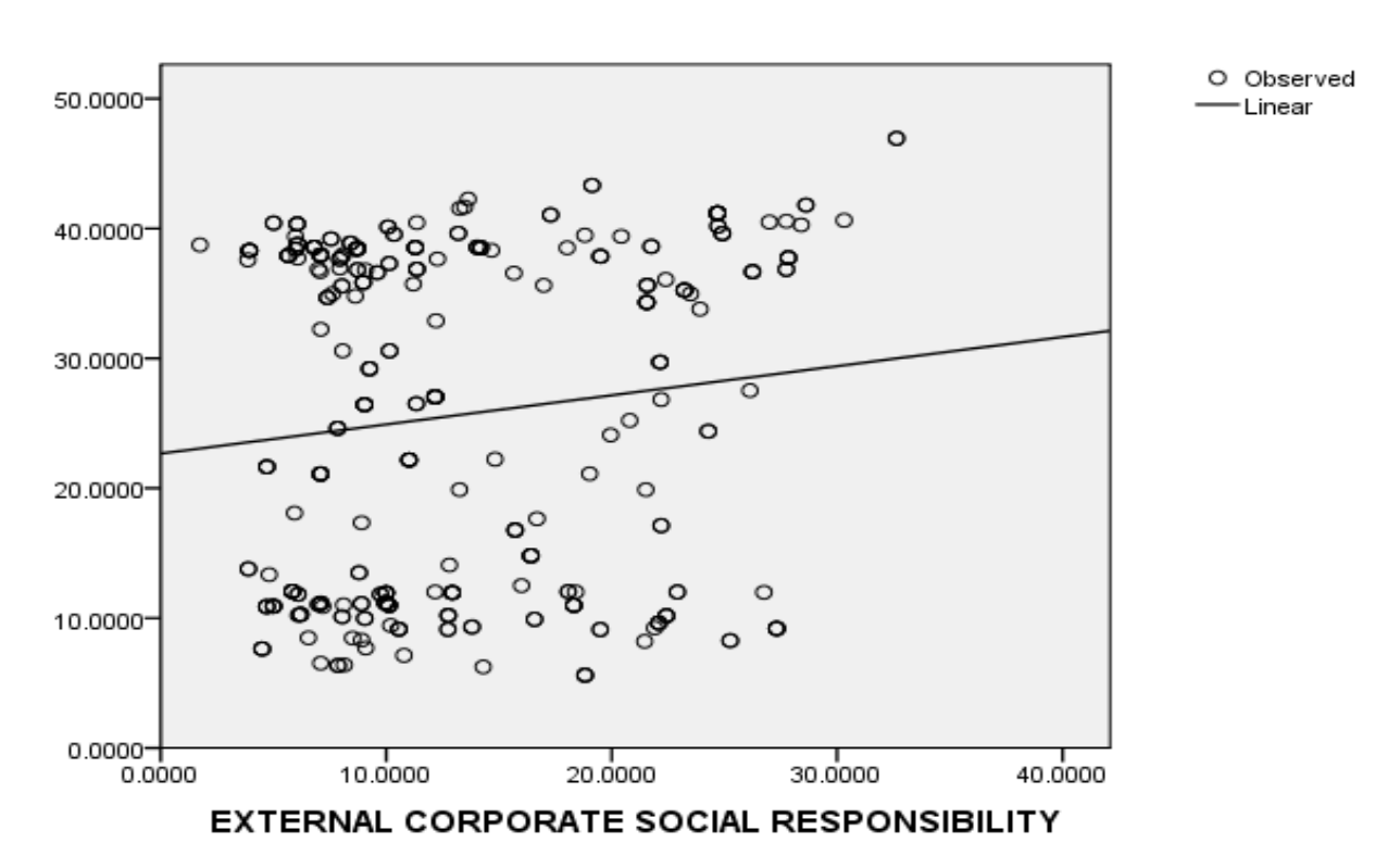
Figure 2: Scatter plot of the relationship between external corporate social responsibility and employee commitment.

Pearson correlation test was conducted to verify existence of corporate social responsibility activities and employee commitment. The findings in Table 1 show a positive and significant correlation of 0.125