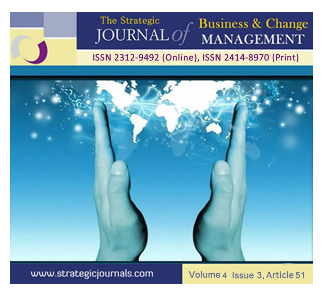
EFFECTS OF LOGISTICS MANAGEMENT ON THE ORGANISATION PERFORMANCE OF SHIPPING FIRMS IN MOMBASA COUNTY