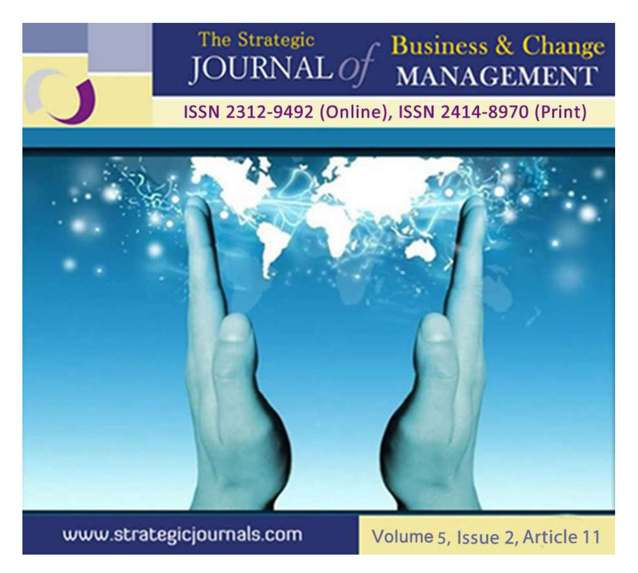
EFFECTS OF COMPETITIVE ADVANTAGE STRATEGIES ON PERFORMANCE OF MICRO-FINANCE INSTITUTIONS AT KENYA WOMEN MICRO-FINANCE BANK