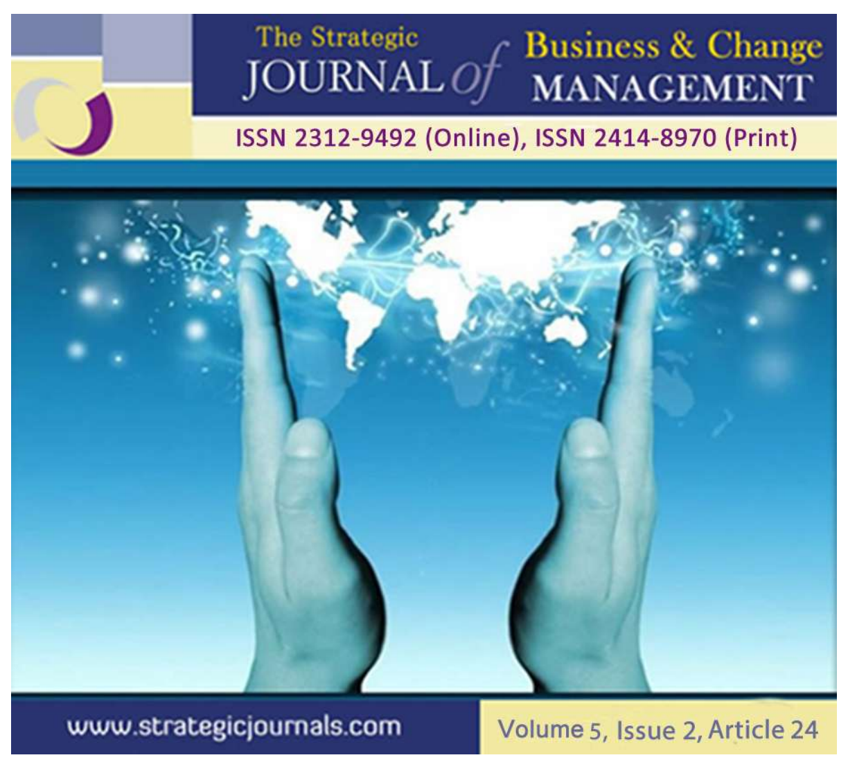
EFFECT OF GREEN SUPPLY CHAIN MANAGEMENT PRACTICES ON PERFORMANCE OF KENYAN UNIVERSITIES. A CASE OF UNIVERSITY OF NAIROBI