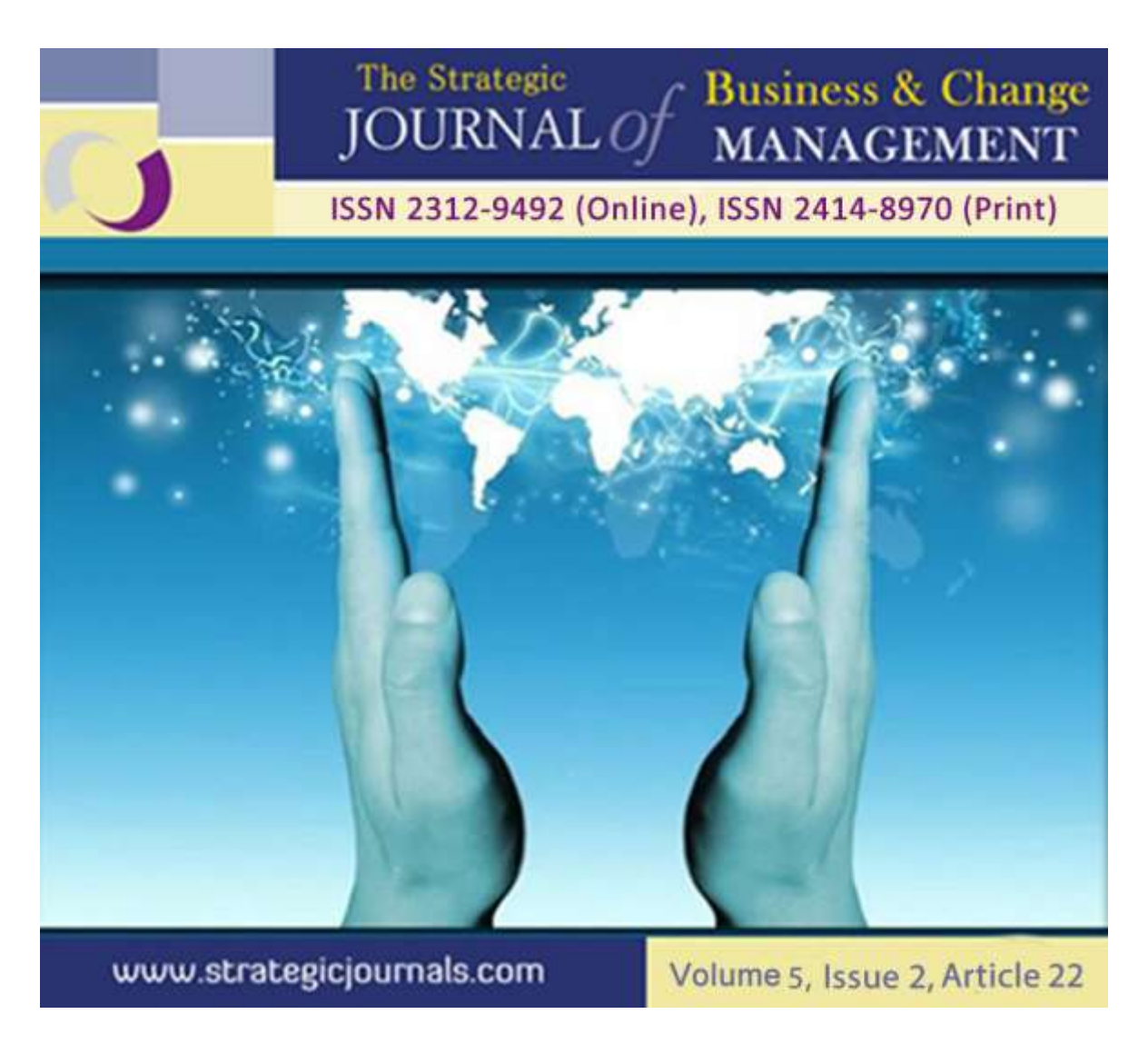
DRIVERS TO IMPLEMENTATION OF PERFORMANCE CONTRACTS IN NATIONAL COUNCIL FOR POPULATION AND DEVELOPMENT IN KENYA