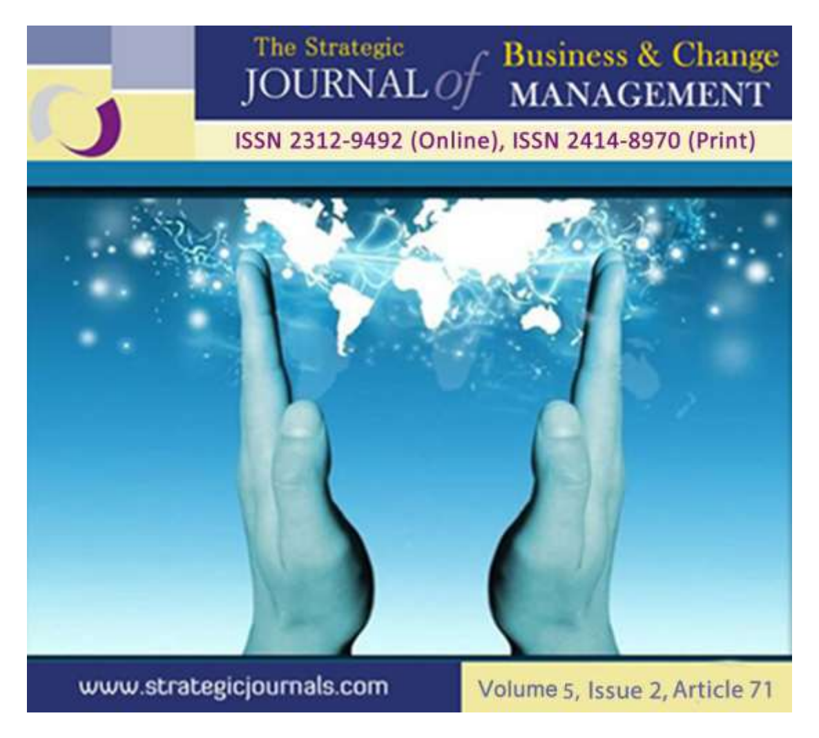
ROLE OF INVENTORY MANAGEMENT PRACTICES ON PERFORMANCE OF THE HOSPITALITY INDUSTRY IN KENYA