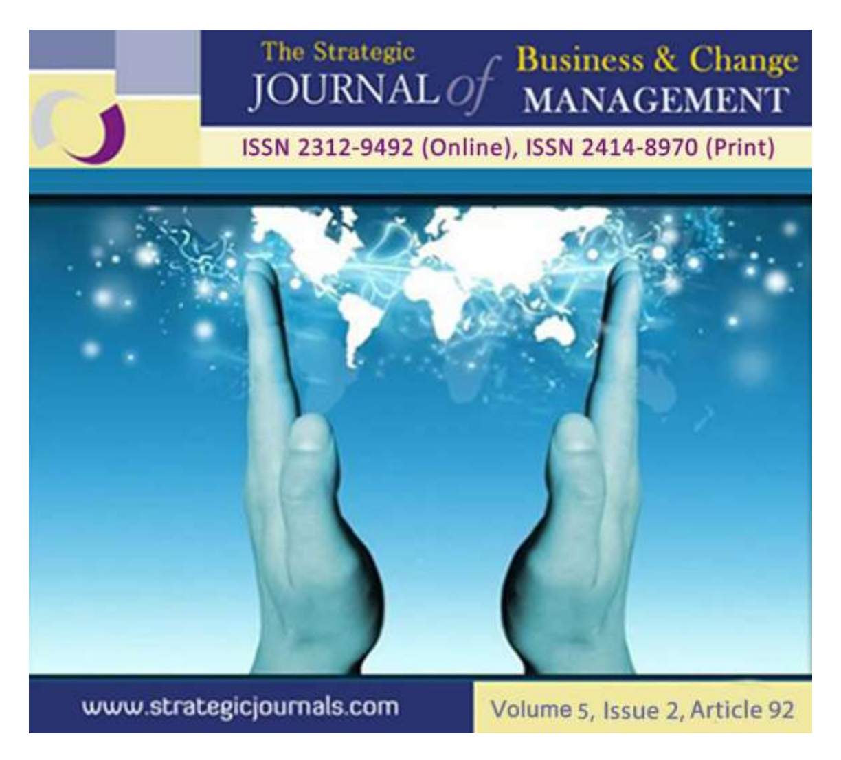
INFLUENCE OF PROJECT MANAGEMENT ON SUSTAINABILITY OF WATER AND SANITATION PROJECTS IN KIBRA SUB-COUNTY, KENYA