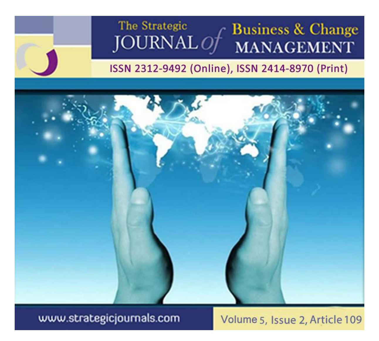
INFLUENCE OF CITIZEN PARTICIPATION ON THE PERFORMANCE OF COUNTY GOVERNMENTS: A CASE OF MAKUENI COUNTY