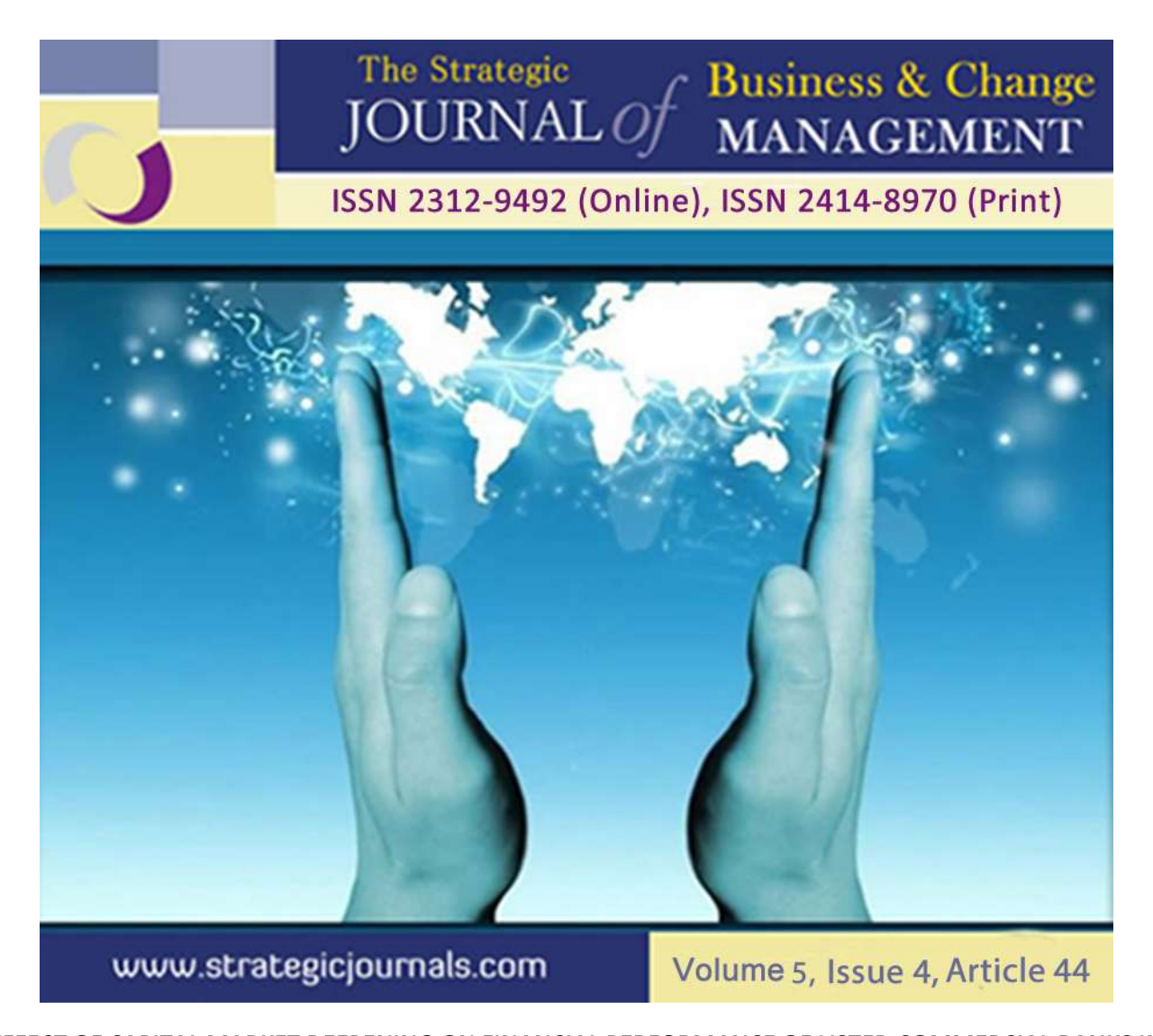
EFFECT OF CAPITAL MARKET DEEPENING ON FINANCIAL PERFORMANCE OF LISTED COMMERCIAL BANKS IN KENYA